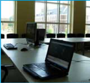
Usability Study Site Mason Hall 201

The Student and Faculty Experience team has added a new tool to their user-centered software development methodologies: Qualitative Usability Studies. On June 20 th , we conducted our first series of usability testing on the re-designed Student Billing pages. We had six participants representing a wide-range of experience and system use.