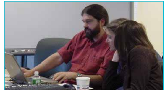
SSET staff collaborating on a reporting issue at the 2008 ISIS User Conference

On March 16, 2009, the Peabody Preparatory went-live on ISIS. Two weeks later on March 30, parents and students were able to register online for summer courses. A process that was not possible with their previous system. Parents and students are accessing the system and appreciate the flexibility of registering and paying for their classes online.