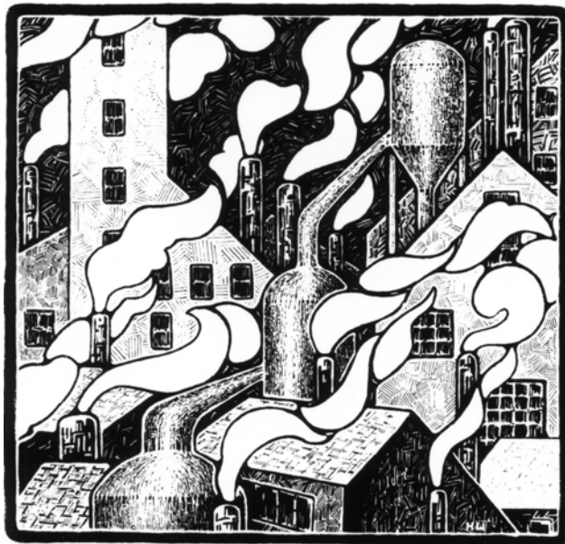
Fig. 10. Man Assumed the Burden of Fire, a smoky drawing with an ironic title, illustrates perhaps the most productive and destructive uses by humans of fire. Wheelon was obsessed with legends concerning the origins of fire. In the 1920s, he created one of his most striking oils, "Prometheus." Both Greek and Native American legends describing the origins of fire are recounted in the poem.

reprints of the balance of the poem appeared, the United States was deeply engaged in World War II, and postal restrictions, combined with Wheelon's heavy, war-time workload, precluded a similarly ambitious mailing of the second volume. 143