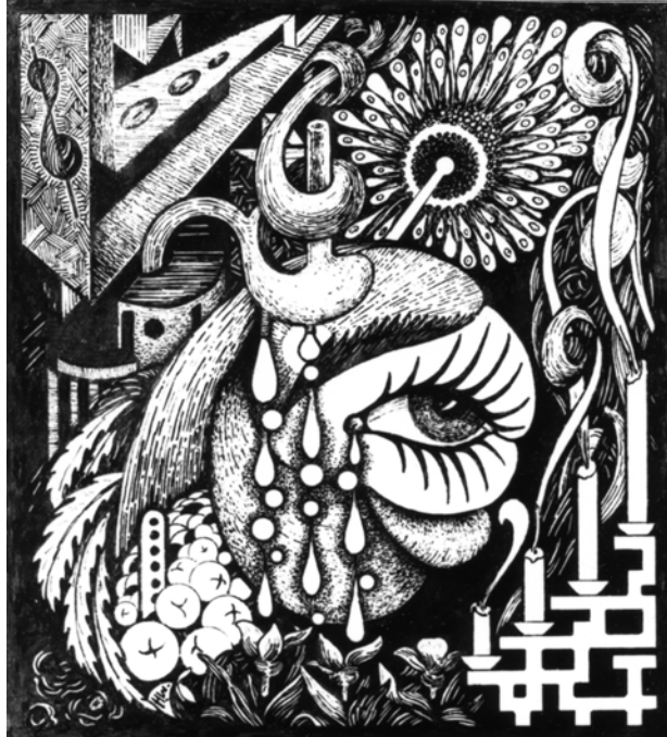
Fig. 9. Symbols Given Meaning, from Rabbit No. 202 , illustrates a discourse on symbols and their uses by humans, both in science and art. It combines a wide range of symbols from music, science, and religion.

The manuscript for Part 2 of the poem contains a long (eventually unprinted) introduction that contains no mention of the rabbit, nor does it promise that the themes of Part 1 will be continued. It concludes: