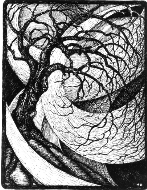
Fig. 6. Winter of disbelief, from Rabbit No. 202 , illustrates a portion of the poem in which Wheelon is describing the origins of rites of spring, relying heavily on Frazer's The Golden Bough . 129 The figure symbolizes the loss of faith in the early goddesses of spring, such as Eastre, as well as the annual disbelief that spring would always follow winter. The illustration is an evocation of the barrenness of both doubt and winter.

Structurally, Wheelon dealt with the broad range of material in the poem by using an outline form. Beginning with a central topic near the left margin, he successively indented subtopics until he had exhausted the central topic. Then, he would return to the left margin and declare another central topic. A section from Part 2 130 of the poem demonstrates this principle.