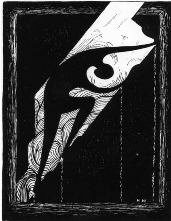
Fig. 8. Slow Ascent—Man, from Rabbit No. 202 , illustrates one of several portions of the poem that describe the evolution of humans. Most simply, it can be seen as a depiction of human evolution from the sea, represented by the swirls at the lower left. However, in the context of the entire poem, it almost certainly represents the slow, uncertain evolution of human culture. Nevertheless, Wheelon's optimism is manifested by the path that goes through the confines of the drawing's frame to freedom.

The tone of the poem is often, but not always, critical. Wheelon was generally suspicious of human institutions and human intellectual constructs, and this skepticism pervades Rabbit No. 202 . At the same time, his overall view of humans as individuals was optimistic. He valued the ability of humans to relate to one another when those relationships were positive and non-exploitative. Indeed, he considered companionship to be the species' highest attainment.