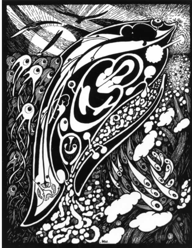
Fig. 1. Animals, Conduits, for the Passage of Food, from Homer Wheelon's epic poem, Rabbit No. 202 . The poem was both written and illustrated by Wheelon, the illustrations being drawn in pen-and-ink in the style of woodcuts. The American Physiological Society later adopted many of the illustrations (including this one) as the tailpieces that follow articles in The American Journal of Physiology and The Journal of Applied Physiology .

The tailpieces that adorn the papers in The American Journal of Physiology and The Journal of Applied Physiology have attracted the attention of most physiologists at one time or another (Fig. 1).