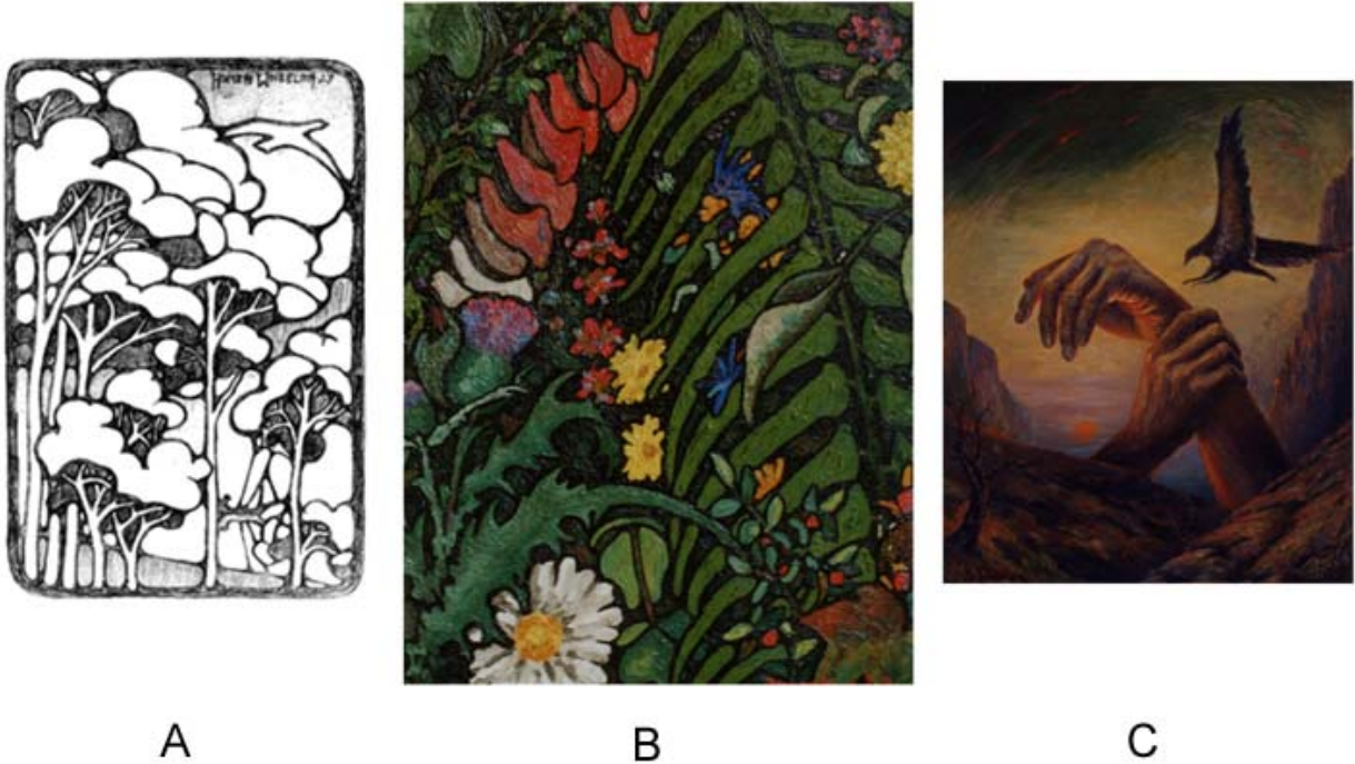
Fig. 5. Examples of Wheelon's artwork during the 1920s. (A) Untitled pencil drawing of trees. He drew many versions of this scene, some of which are delicately tinted. (B) Untitled oil of ferns and flowers. (C) "Prometheus," painted in the early 1920s. This oil painting portrays his own hands in a rendering of the Greek myth of the god who stole fire from the other gods and delivered it to humans. Unlike the Greek god, Wheelon's Prometheus is bound only by himself.

His styles were equally varied. During the 1920s, they ranged from realistic, pastoral landscapes, through surrealistic, metaphorical paintings, to pure designs. Both his realistic work and his abstractions drew praise from critics. 119 Although many of his realistic works, mostly landscapes, were gentle and unchallenging, his abstractions could be dark and even threatening.